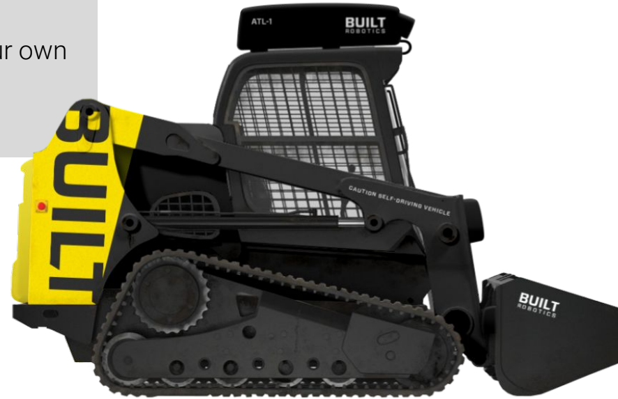
Our autonomous track loader (ATL)