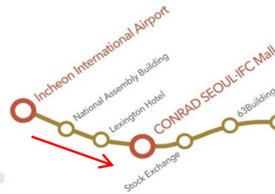
6030 Bus route