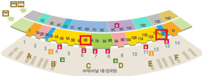
Bus stop at Incheon airport

Bus stop is at 1 st Floor Gate 6B, 13A in Incheon International Airport Bus ticket purchasing is at gate 4 or 9